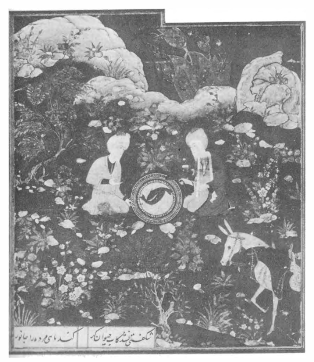
1 Elijah and Khidr at the Fountain of Life <sup>7</sup> Persian, School of Herāt, late fifteenth century