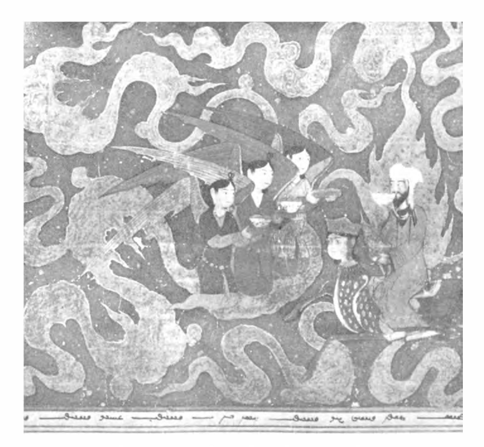
4 Three Angels Offering Three Cups to the Prophet Bibliothèque nationale, Paris, MS supplément turc 190